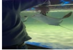
Jody Sue - March 19 at 03:16 AM